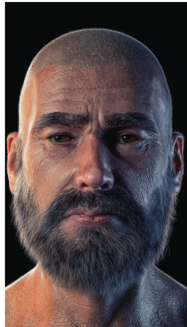
Concept by myself Responsible for all aspects