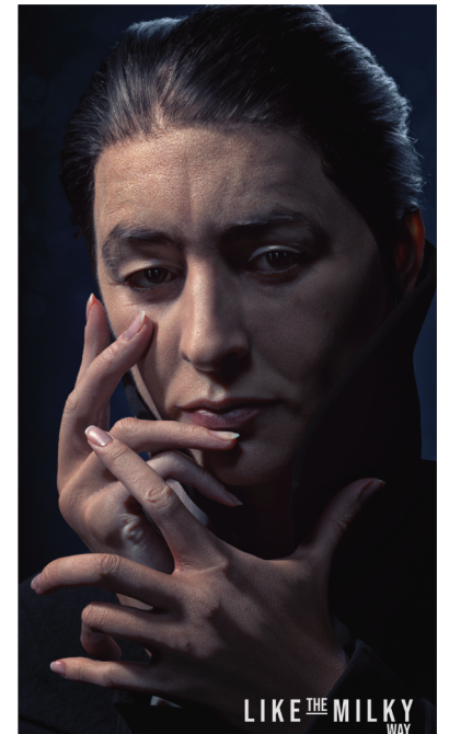
inspired by a photography of Georgia O'Keeffe by Alfred Stieglitz Responsible for all aspects